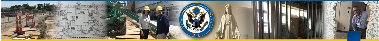
An e-Newsletter for the Families of Notre Dame Academy